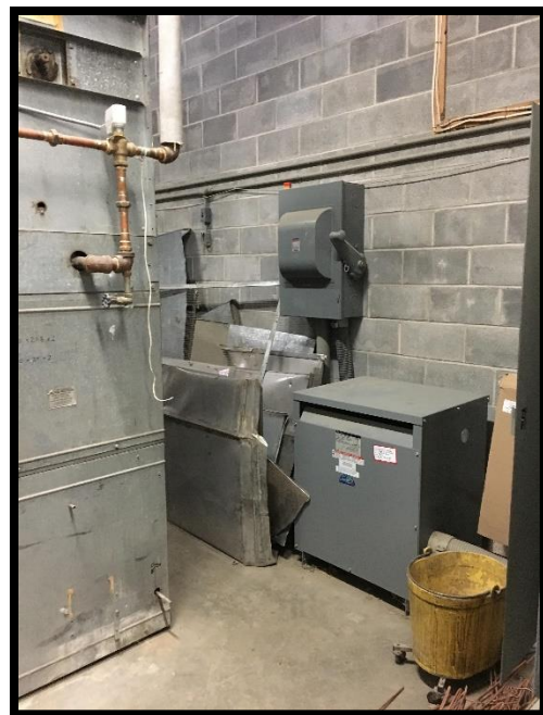
Air Handling Alterations and Mechanical Work