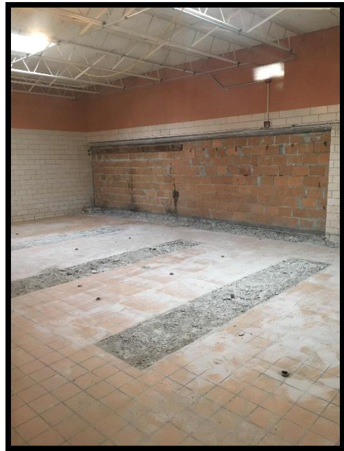
Boys & Girls Locker Room Renovation